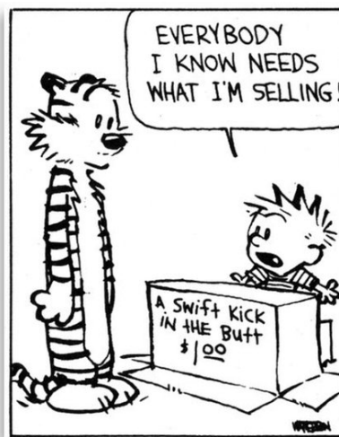
Bill Waterson's Calvin and Hobbes

Get the information you need – when you need it. Click http://geni.us/BRAZO to install BC Connect on your mobile device to receive reminders, explore careers, map your educational plan, be in the know about events, find out about scholarships, achieve your goals and much more.