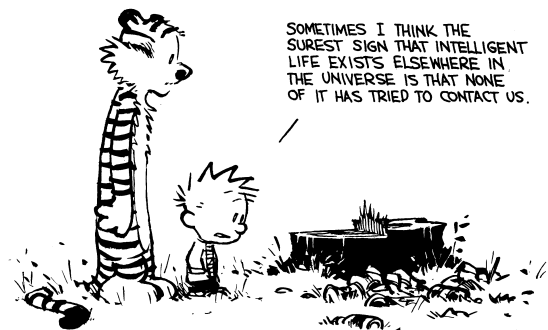
Fig. 1 Bill Waterson's Calvin & Hobbes

This course will, among other things, cover Native Cultures, Early Colonization, Empire Building, Colonial Development, The French and Indian War, The Revolutionary War, From Republic to Democracy, Jacksonian Democracy, Manifest Destiny, Prelude to War, Secession, the Civil War and Reconstruction.