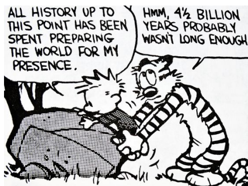
Fig. 1 Bill Waterson's Calvin & Hobbes

America: The Essential Learning Edition Volume 1 ; 2 nd Edition; by David Shi & George Tindall; Norton & Company Publishers. ISBN: 978-0-393-64301-5.