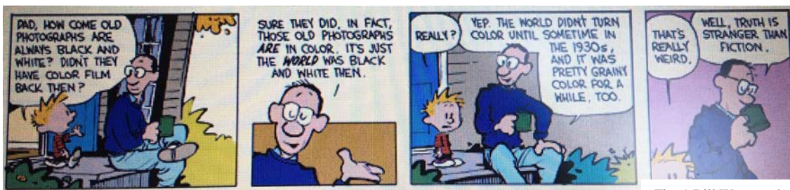
Fig. 1 Bill Waterson's Calvin & Hobbes

Academic dishonesty violates both the policies of this course and the Student Code of Conduct. In this class, any occurrence of academic dishonesty will be referred to the Dean of Student Services for prompt adjudication, and will, at a minimum , result in a zero on the assignment in this course. Additionally, you will not be eligible to receive any of the benefits in this course (such as extra credit, etc.). Sanctions may be imposed beyond your grade in this course by the Dean of Student Services.